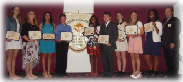
2013 Scholarship Recipients

The 2014 Scholarship Breakfast is coming to the Council Hall Sunday June 8, following the Quarterly Communion Mass. This event is the culmination of the hard work done year round by the Knights to raise funds for deserving students!