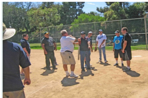
Food and fellowship was followed by a spirited game vaguely resembling softball

Visit the Council website ( www.kofc3744.org ) Member Home page Photo Album for over 30 pictures of the fun, food and activities. Make a mental note for next year to be sure to attend this great Council sponsored family activity!