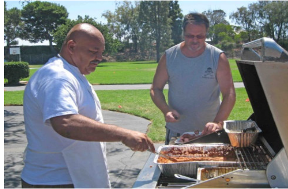
Brother Knights over the grills cooking up delicious burgers and hot dogs