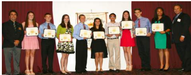
2014 Scholarship Recipients

The 2015 Scholarship Breakfast is coming to the Council Hall Sun June 14 following the 9:00am Communion Mass at St Jerome. This event is the culmination of the hard work done year round by the Knights to raise funds for deserving students!