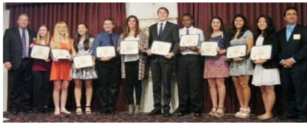
2015 Scholarship Recipients

The 2015 Scholarship Breakfast is coming to the Council Hall Sun June 12, after the Quarterly Communion Mass (parish TBA). This event is the culmination of the hard work done year round by the Knights to raise funds for deserving students!