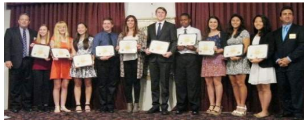
2015 Scholarship Recipients

The 2016 Scholarship Breakfast is coming to the Council Hall Sun June 12 following the 9:00am Communion Mass at St Anastasia. This event is the culmination of the hard work done year round by the Knights to raise funds for deserving students!